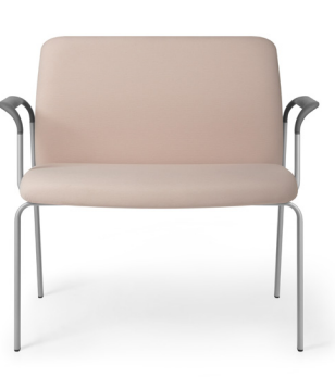
GINNY BARIATRIC (GY4-B)