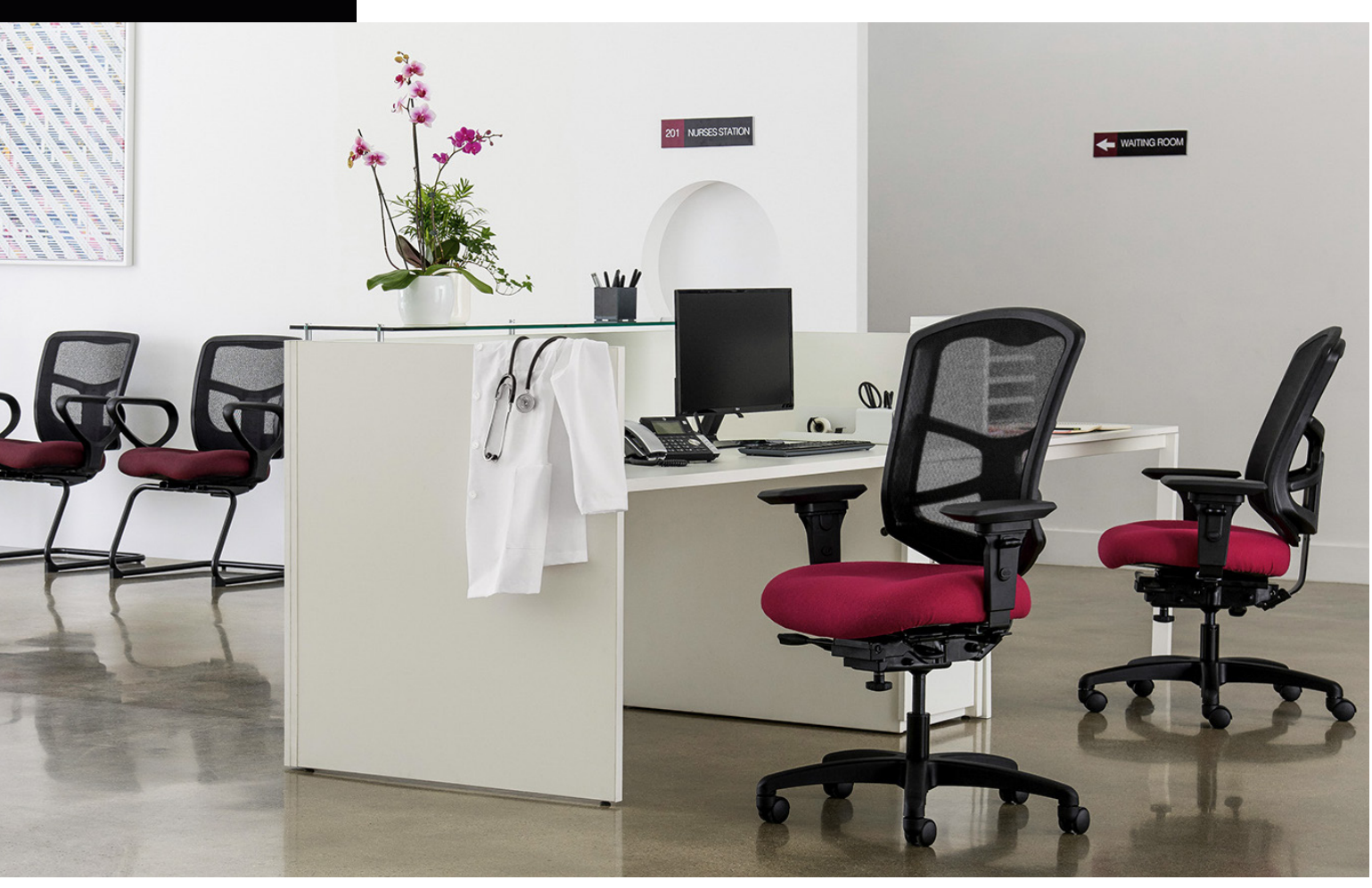
Yes, task and guest