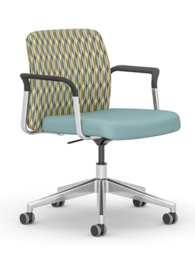
GINNY MULTI-TASKER (GY4-T)