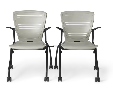
OM5 ACTIVE* NEST (OM5-AN)