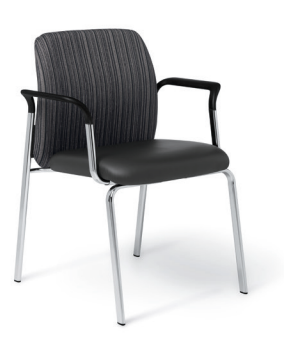
GINNY GUEST (GY4-G)