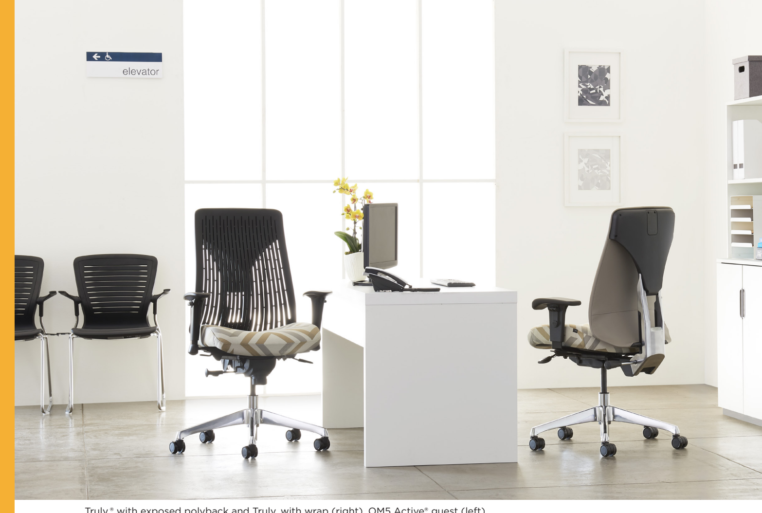
Truly.® with exposed polyback and Truly. with wrap (right), OM5 Active® guest (left)

We look to the experience and knowledge of healthcare professionals and experts to design seating solutions that work for them.