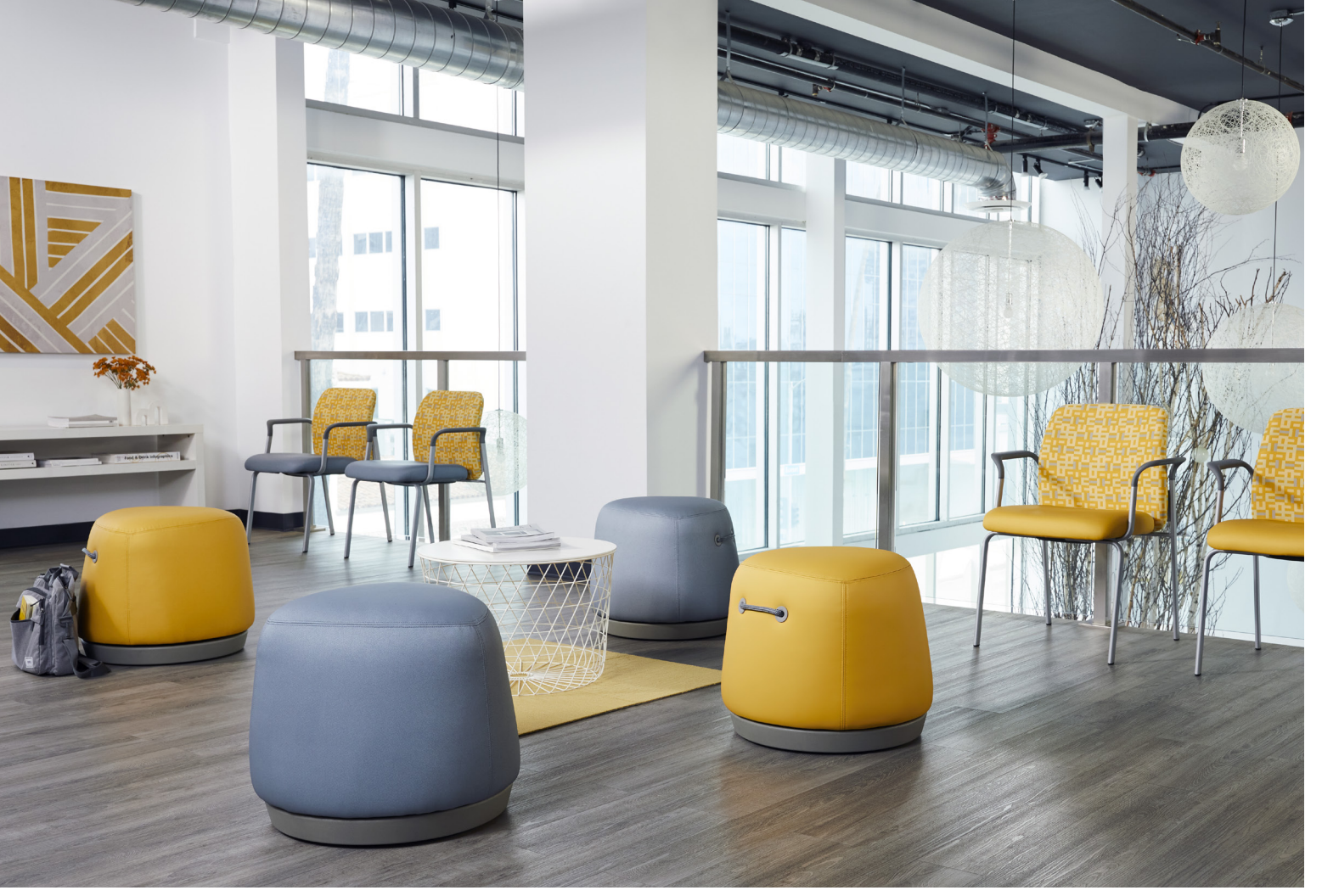
Plot Twist™ pouf and Ginny guest