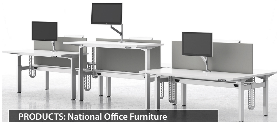
PRODUCTS: National Office Furniture Introduces Alloy Benching