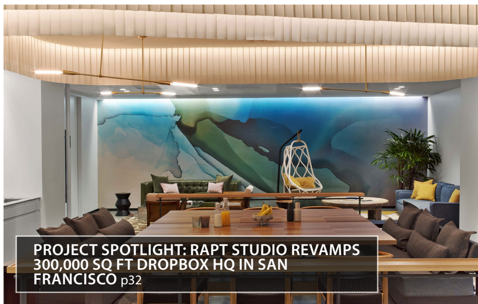
PROJECT SPOTLIGHT: RAPT STUDIO REVAMPS 300,000 SQ FT DROPBOX HQ IN SAN FRANCISCO