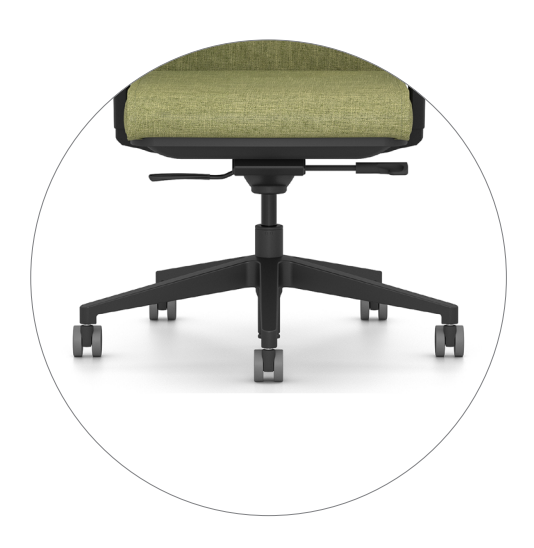
Black Base Package includes black cylinder and multi-surface casters.