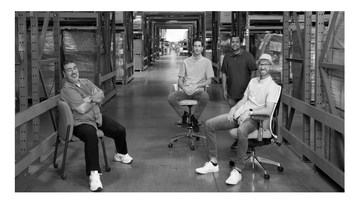
OM Design Group

OM has been making seating since 1986. Over time, we've gathered valuable institutional knowledge about what makes good chairs great. But, we truly believe that learning never stops. So, we take great pains to actually do what many companies say they do – we listen to customers, take in feedback and opinions from end users, ergonomists, designers, dealers, architects and more; in other words, our influencers. We reject thoughtless copy-catting, and we pride ourselves on having a diverse product development pipeline that enables us to ultimately find the right designs to bring to market. Today, OMDG is comprised of Listeners, Thinkers and Doers representing a balanced mixture of perspectives and approaches... all with the single goal of making your work life, work better!