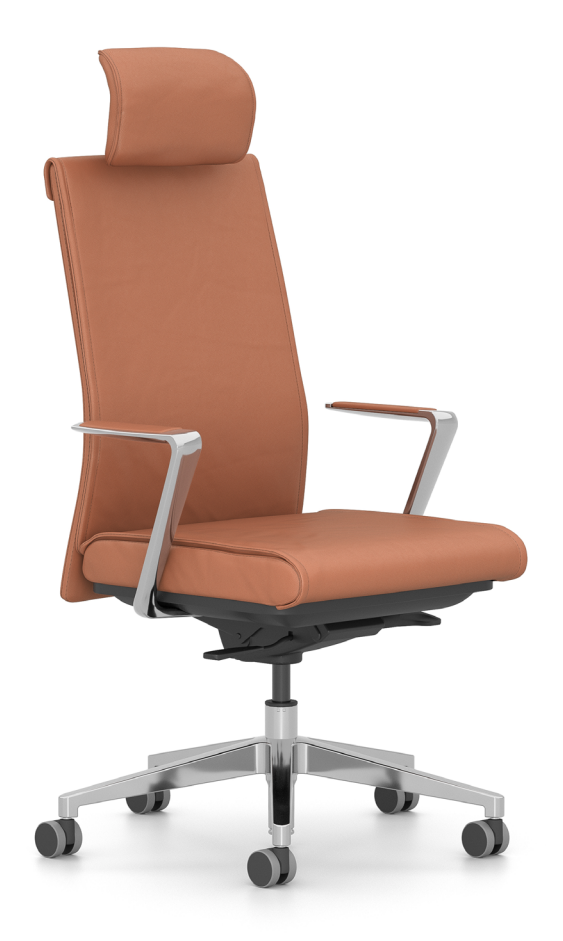
Pillow Top Styling