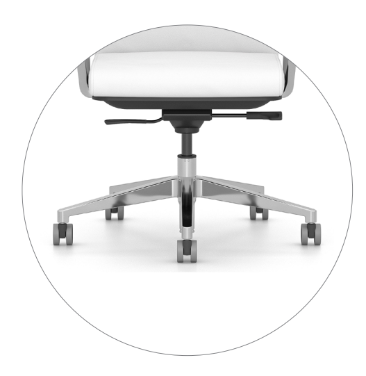
Polished Package includes chrome cylinder and multi-surface casters.