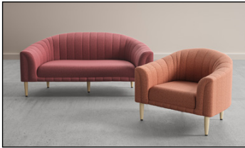
34 | National Office