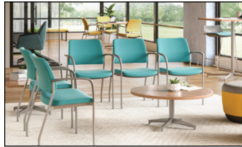
38 | SitOnIt Seating