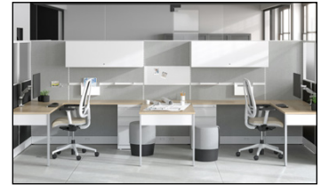
59 | Lacasse PARADIGM