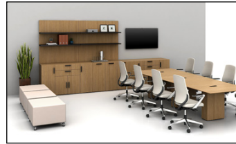
42 | AIS