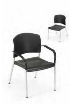
SG3A (arms) & SG300 (armless) Stackable Guest Chairs

SPECIFICATIONS Overall width 23" (arms) & 21" (armless) Overall height 32" Back