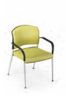
SG3W Stackable Guest Chair

SPECIFICATIONS Overall width 23" Overall height Back