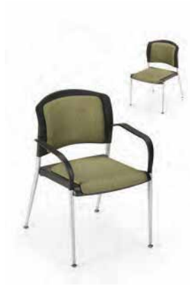
SG3B (arms) & SG3C (armless) Stackable Guest Chairs

SPECIFICATIONS Overall width 23" (arms) & 21" (armless) Overall height 32" Back 19"w x 16"h Seat 18"w x 19"d Seat height 18" Warranty 7 year limited