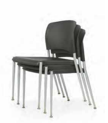
SG300 STACKS UP TO 5 HIGH ON FLOOR