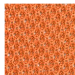
5306 Del Ray