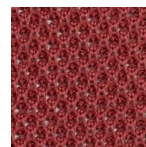
5307 Sunset Junction