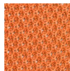
5306 Del Ray