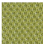
5308 Joshua Tree