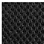
5300 Echo Park