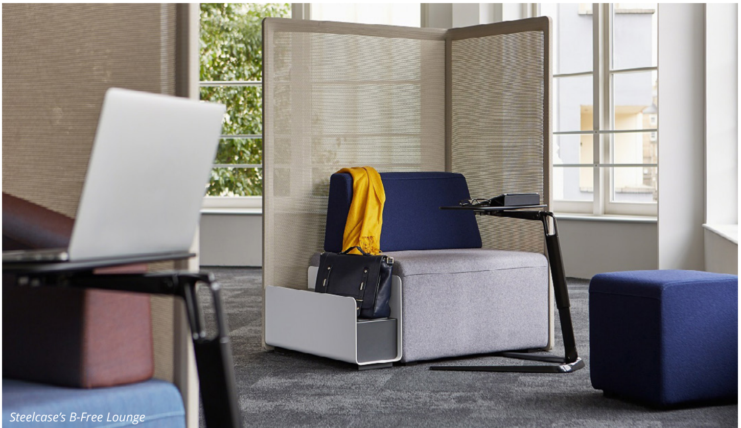
Steelcase's B-Free Lounge