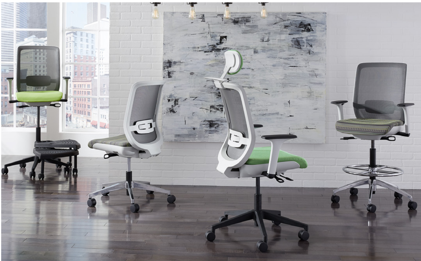
Neutral Posture's Icon