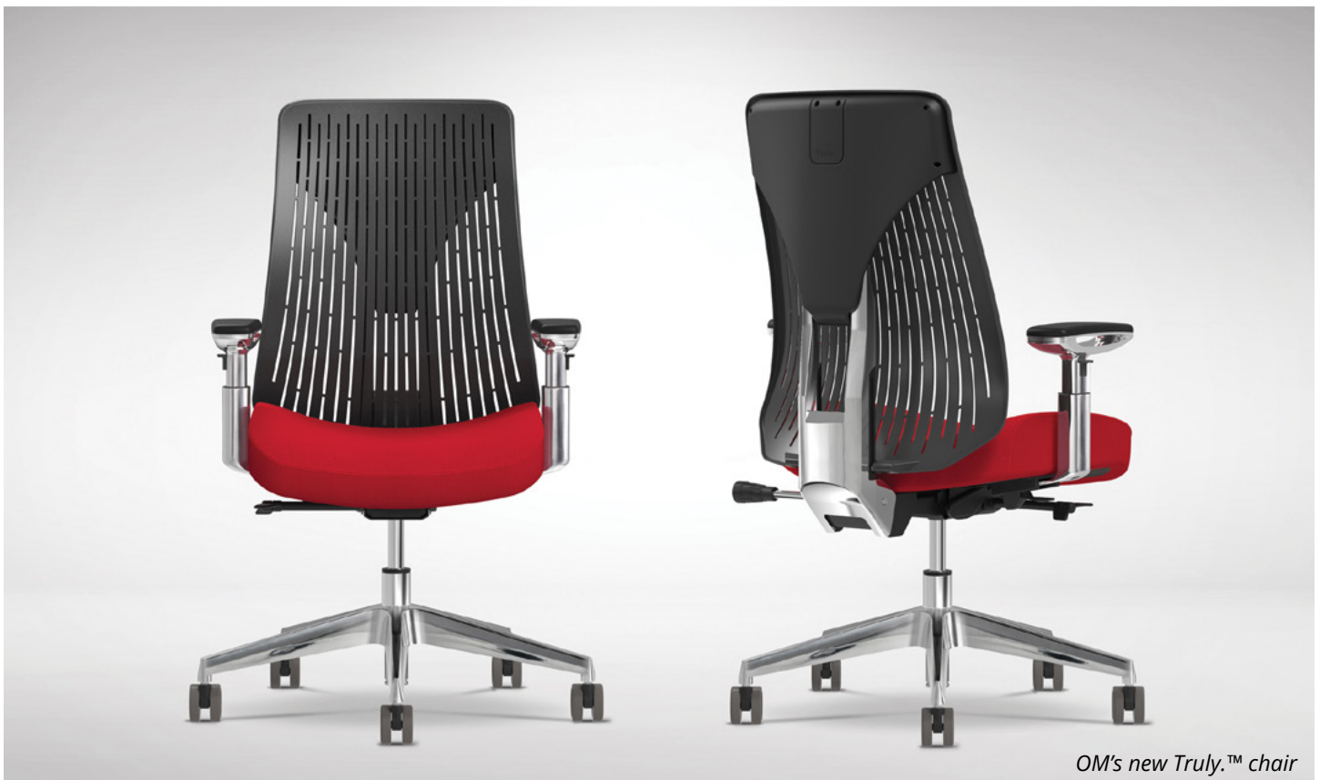
OM's new Truly. ™ chair

It was a big year for really good seating at NeoCon 2016. Haworth's Fern is worth a look, but we like OM's new Truly. ™ chair. It is the company's best chair to date and marks a real turning point for OM because it adds some