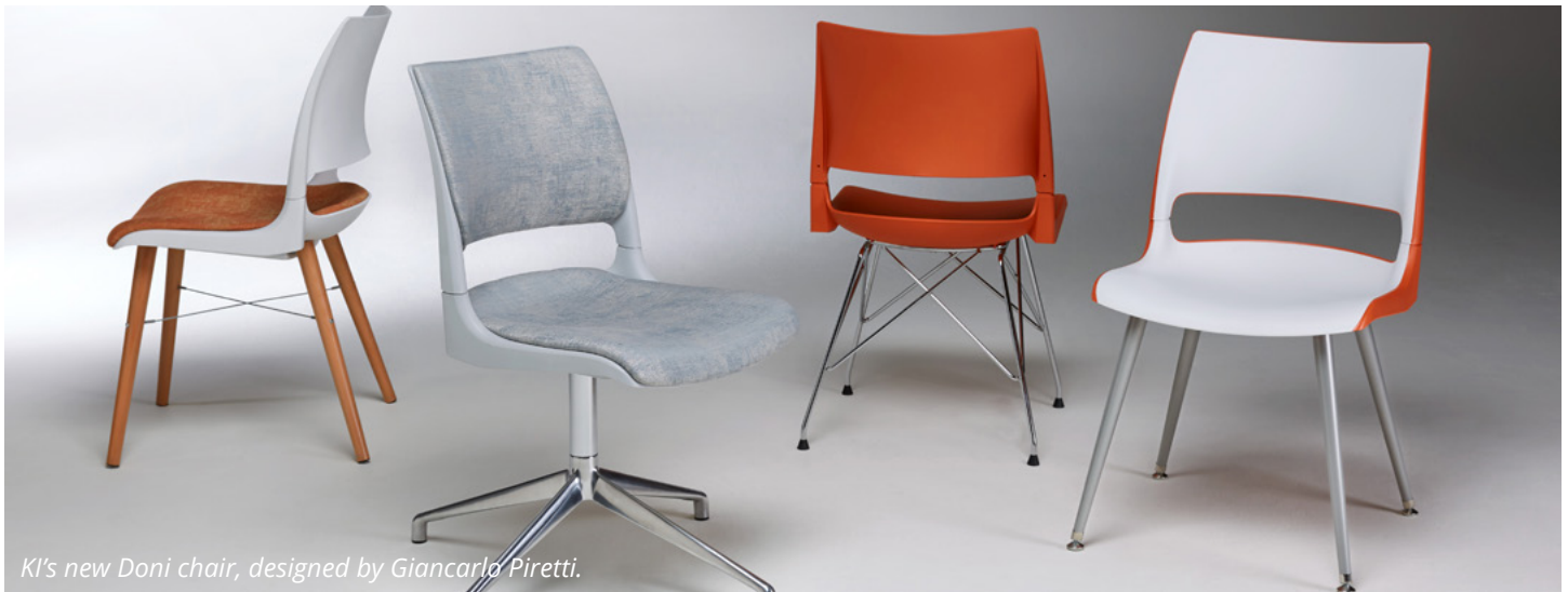
KI's new Doni chair, designed by Giancarlo Piretti.

S o it's Wednesday at NeoCon, you are sick of looking at the same old furniture, and you want to see some cool stuff on the day when it is actually copacetic to do so. With hundreds of showrooms to choose from, where does a curious industry insider start?