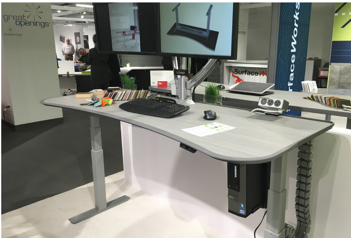
Focus from SurfaceWorks

be complicated to be great. B-Free can be seen at 300.