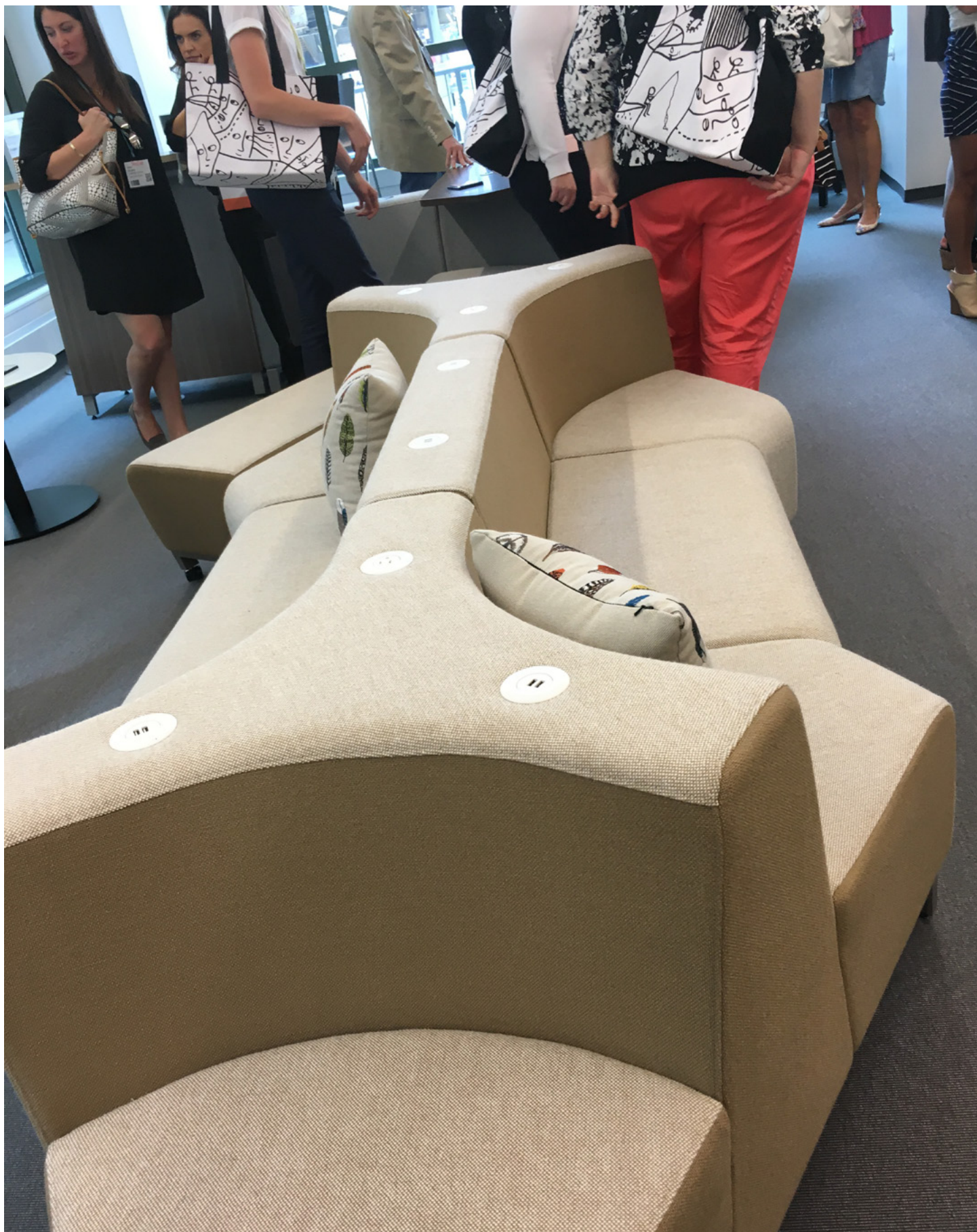
National's Kozmic collection of lounge-like furniture